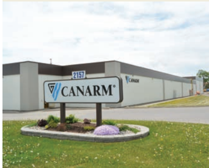
2157 Parkedale Avenue, Brockville Canarm's Corporate Headquarters since 1963

Canarm has been supporting Brockville General Hospital for decades. They have supported Campaign for Care, Friends of Palliative Care Golf, Hole-in One Fundraiser, Under One Roof, Brockville Cardiovascular Program and third-party events.