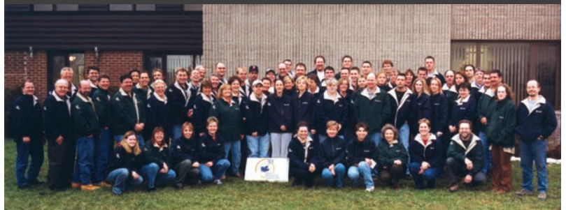
2009 - Canarm employees celebrate being one of Canada's Best Managed Companies. Canarm maintained this status for over 7 years, and now has been honoured with the prestigious Platinum Member status.